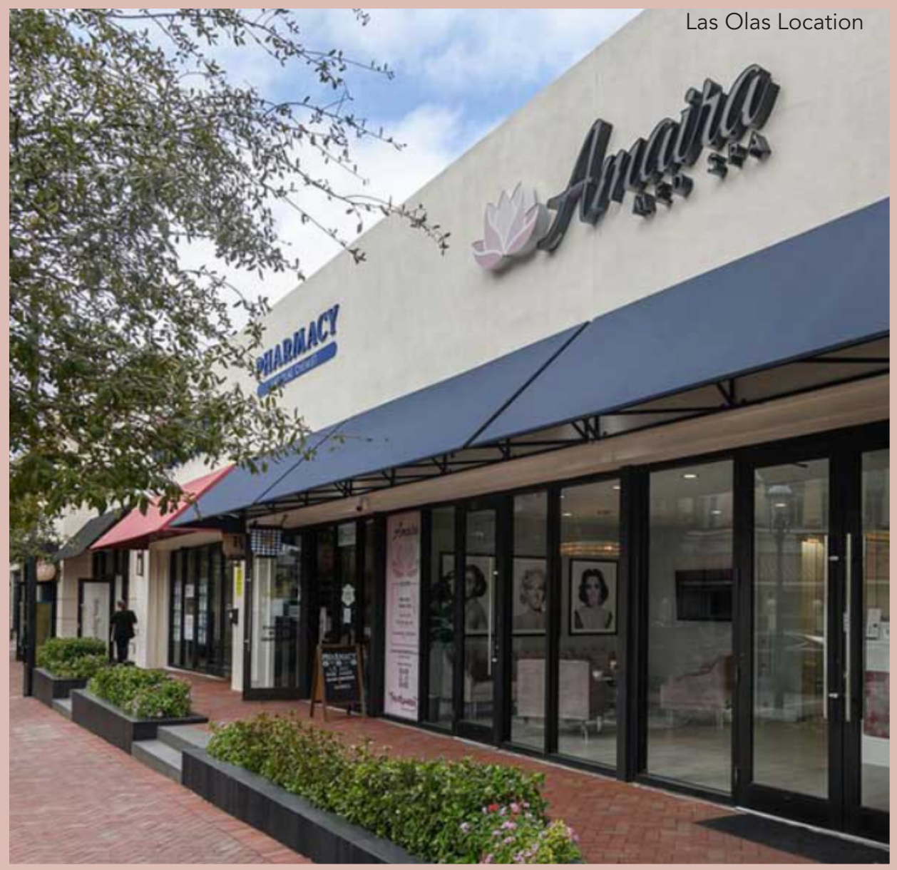
Las Olas Location